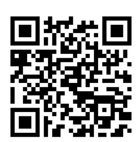
For more details Scan the QR Code